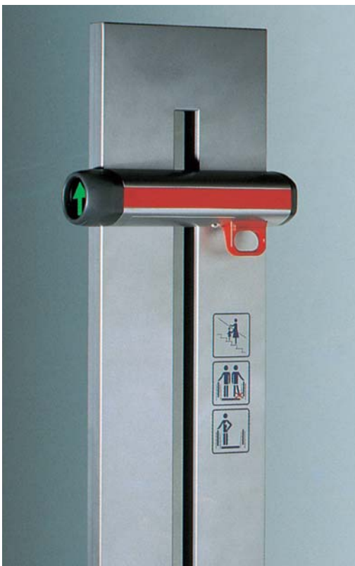
◀ Multifunction post

Quality - All components have been tested and proven. Systems and sub-systems have been designed within ISO 9001 certified procedures. Each escalator is assembled and tested before shipment.