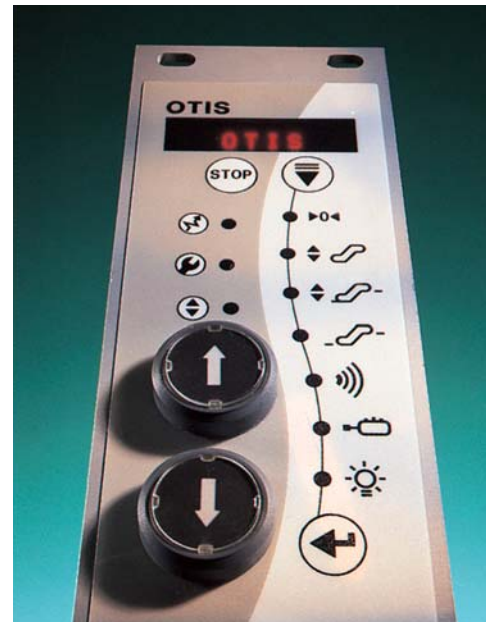
▲ Control panel

Otis 513 NPE's advanced technology - such as the programmable logic controller or microprocessor controller with variable speed converter, the control panel to check the actual working conditions, interfaces for remote monitoring and control - corresponds to customers' requirements for safer operation, extended lifetime of components, even when facing heavy duty traffic, optimum availability and low operation cost requirements.