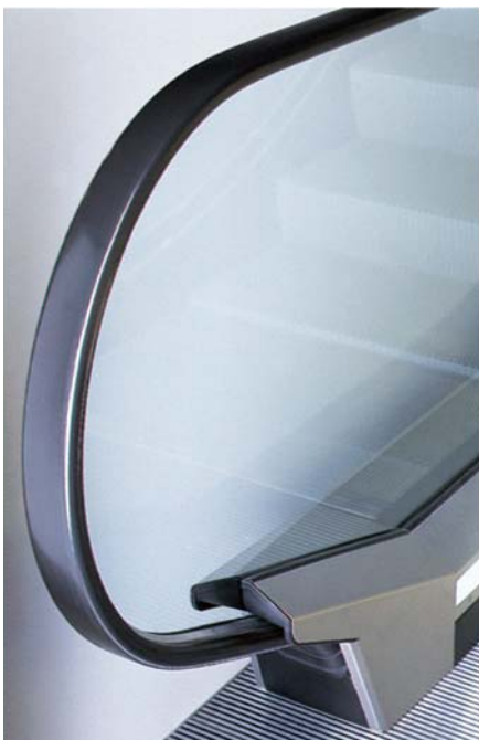
◀ Vertical glass balustrade

Design - Different balustrade designs allow optimal adaptations to the application and architecture.