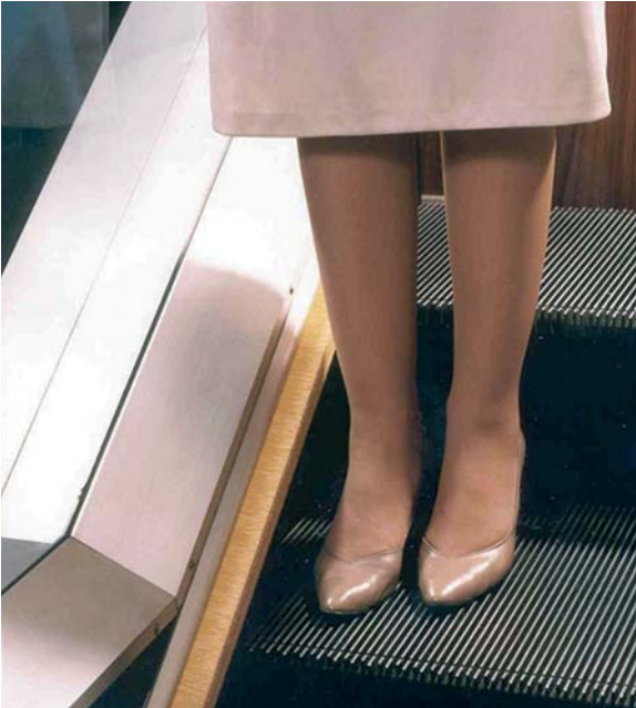
◀ Brush guards

Protection of passengers - Brushes prevent objects from getting caught between the steps and skirt panels. A plastic spine with two rows of staggered bristles made from black nylon are highly resistant to flammability.